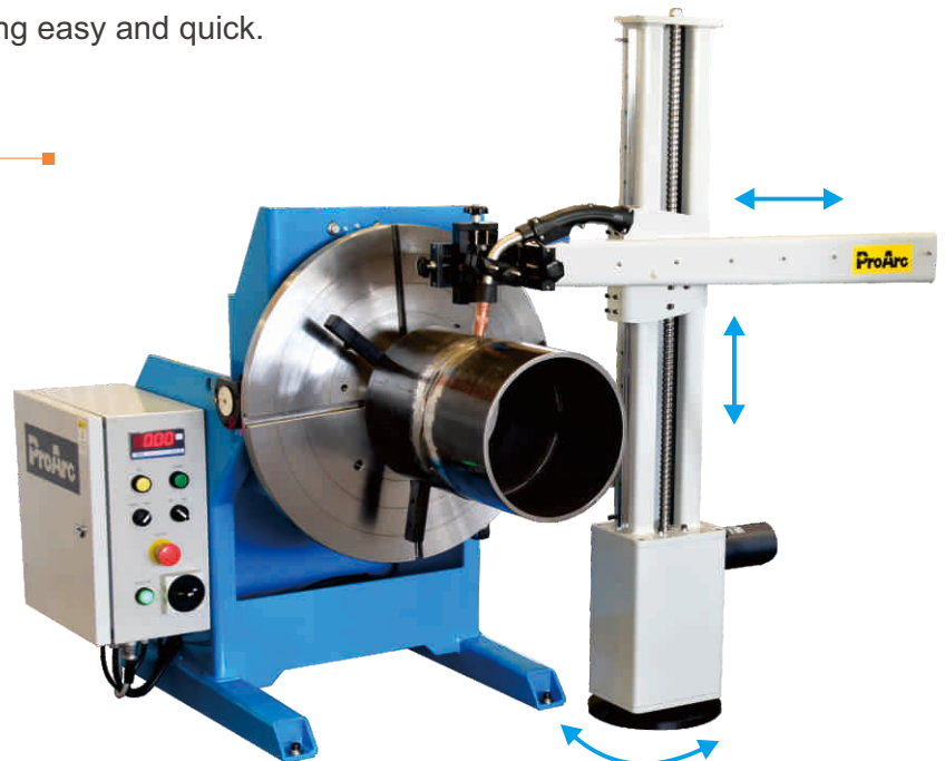
■ MP-0606 with PT-750